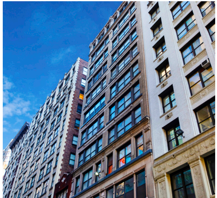
Hidrock Properties and Rudder Property Group's recent office condominium conversion at 35 West 36th Street